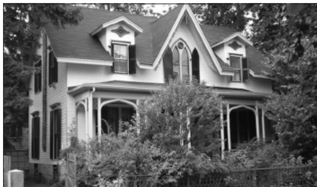
29. Samuel Lumbard House