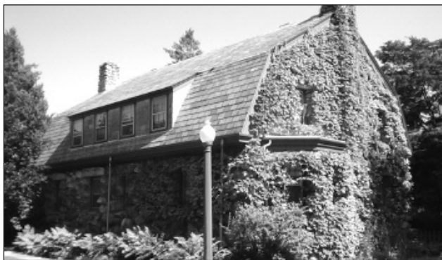
40. William Nye, Jr. House