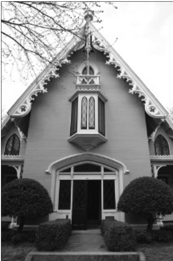
13. William J. Rotch Gothic Cottage

Presented by The New Bedford Preservation Society, Inc.