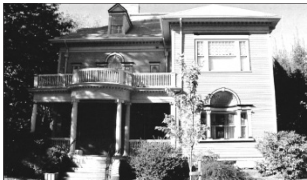
45. Frederick Damon House