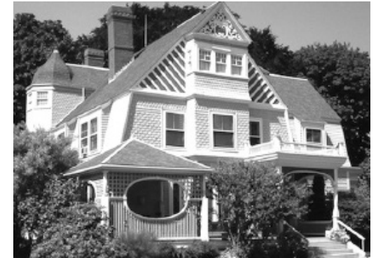
4. Andrew Pierce House